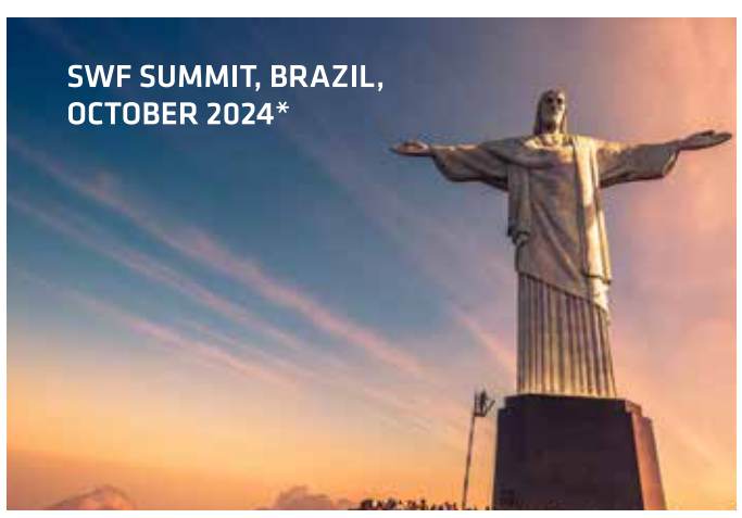
*Note: The dates and the location are subject to change. See SWF Summit for up to date information.